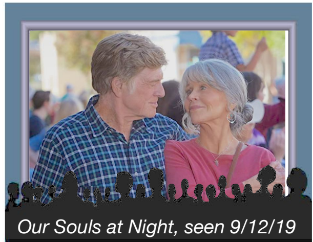
Our Souls at Night, seen 9/12/19

Best wishes to all and hopes you had a peaceful holiday season. Due to the Covid-19 pandemic, the Movie Group will not meet in January. We all look forward to safely viewing and discussing wonderful films again!