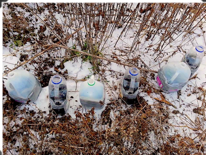
ABOVE - what the jugs will look like for the rest of the winter:

RIGHT - This is what they will look like in spring, when the seedlings have sprouted and grown a bit but aren't yet ready to plant in the ground (I'll let you know when to remove the tape and open the top half):