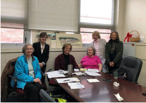
Communications Committee Spring 2019