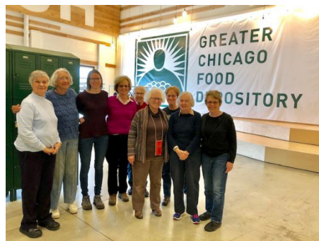
Service League members volunteered at the Greater Chicago Food Depository on May 7, 2019.