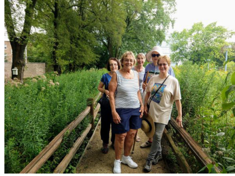
Walking Group Summer 2019