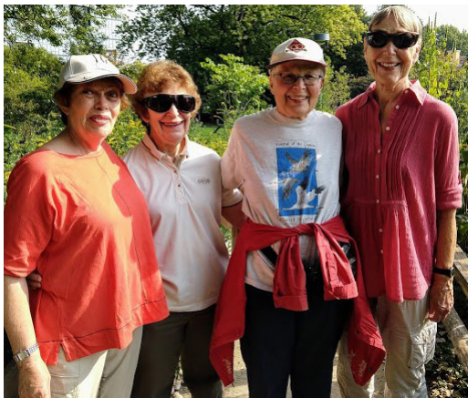
Walking Group Early Fall 2019