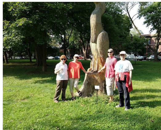
Walking Group Early Fall 2019