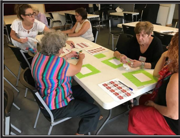
The Art of Aging Project at a Drop-In