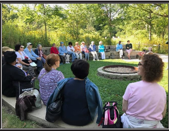
Field Trip to the Cook Co. Forest Preserve